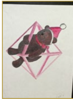
Yuki Gao's Bear in a Polyhedron