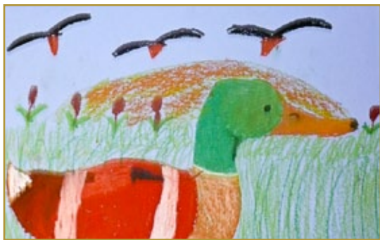
Cate Lee's Decoy Duck